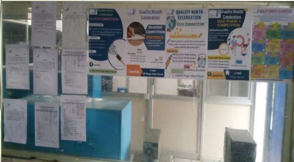
a. Display @ Main plant