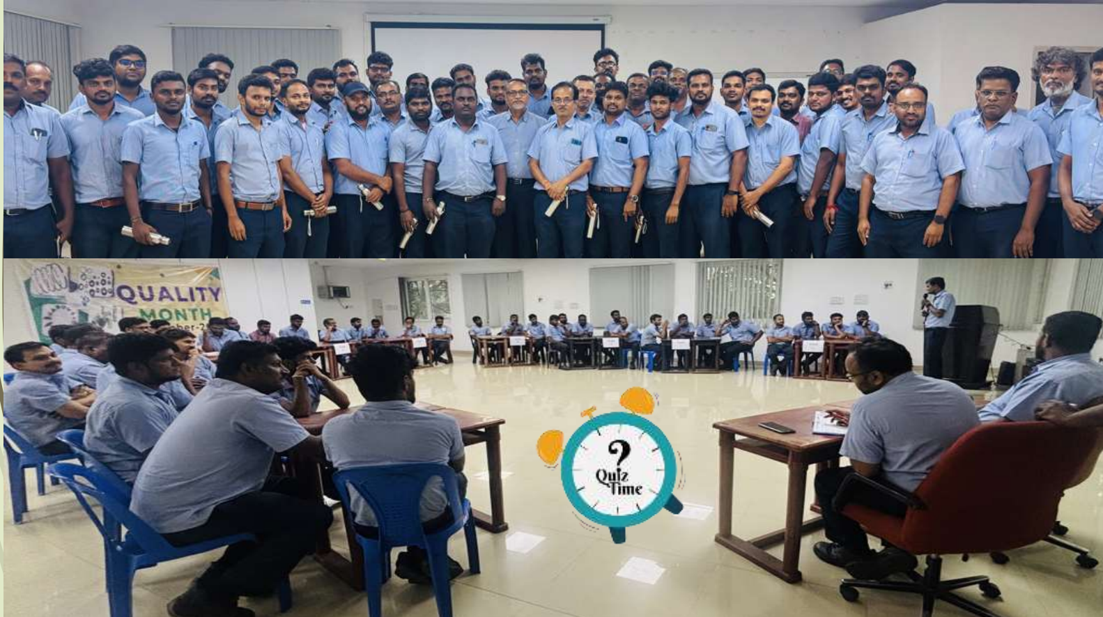
Mono-act Round performed by Leaders